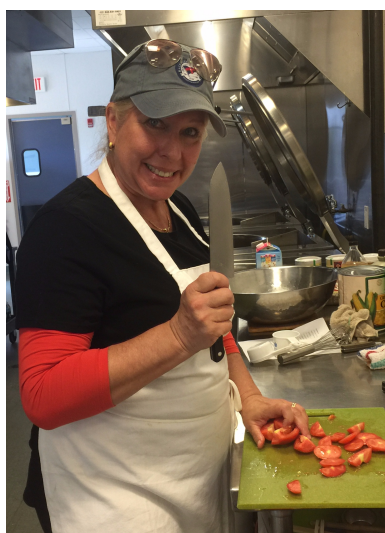
Volunteers with Chef-ing experience just showed up when asked!