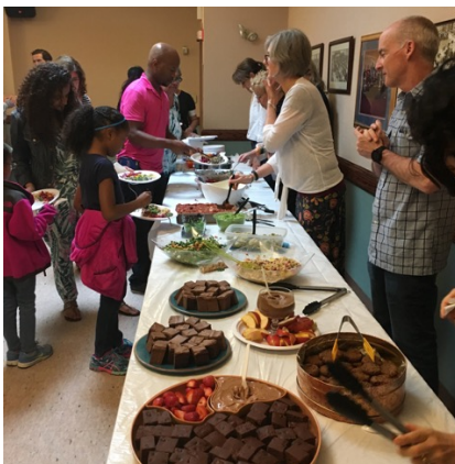
Volunteers serving participants & families at the Graduation Potluck

At the end of the program, the organizers from the Powered by Plants Pod hosted a Graduation Potluck meal for all the participants and their families. The experience underscored for them the wide range of delicious foods that can be part of a plant-based diet and reiterated why a community effort makes for lasting change.