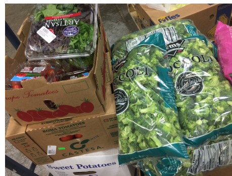
Carts and cars filled with food on our three shopping excursions. Usually 4 carts and three cars full!

Kim led the Pilot with the help of several other community leaders from the Powered By Plants RI Pod. A professional chef ran the kitchen and food preparation for the 14-day meal program, while other Pod members arranged shopping trips to procure ingredients, served meals, cooked with the chef, and delivered food to events. “This was truly a grassroots community effort! Over 25 people from the Pod participated in a range of activities from shopping, preparing food, teaching participants how to cook, and more, representing well over 350 man-hours of work!” said Kim. “Everyone stepped up in a very big way. We were all thrilled with the opportunity to share this information with others.”